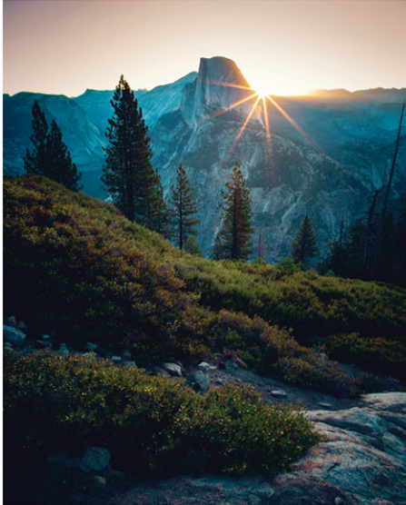
The view of Half Dome from Glacier Point during a Summer sunrise.