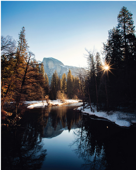
The view of Half Dome from Sentinel Bridge over the Merced River during a Winter sunrise.