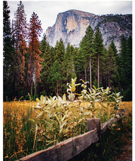
The view of Half Dome from Stoneman Meadow during Fall.