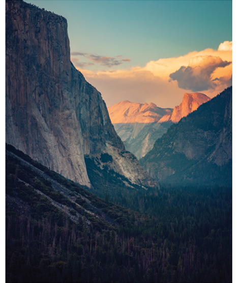
The view of Half Dome and El Capitan from Tunnel View during a Summer sunset.