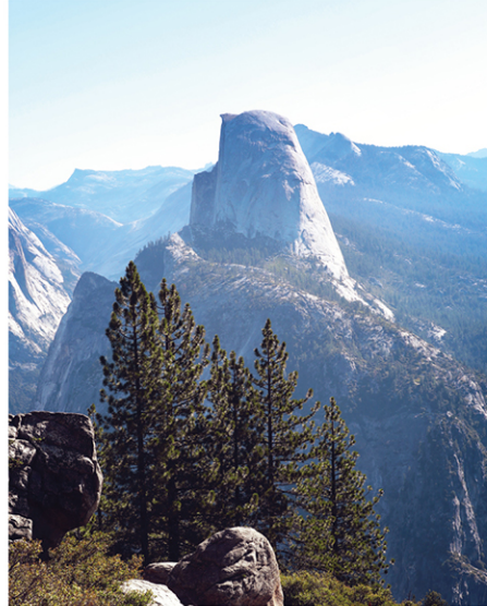
The view of Half Dome from Washburn Point in the Spring.