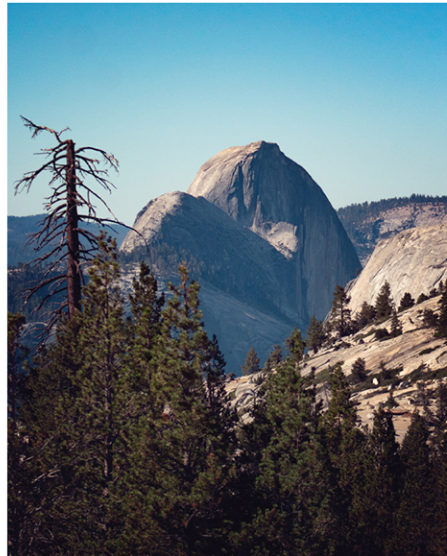
The view of Half Dome from Olmsted Point during Summer.